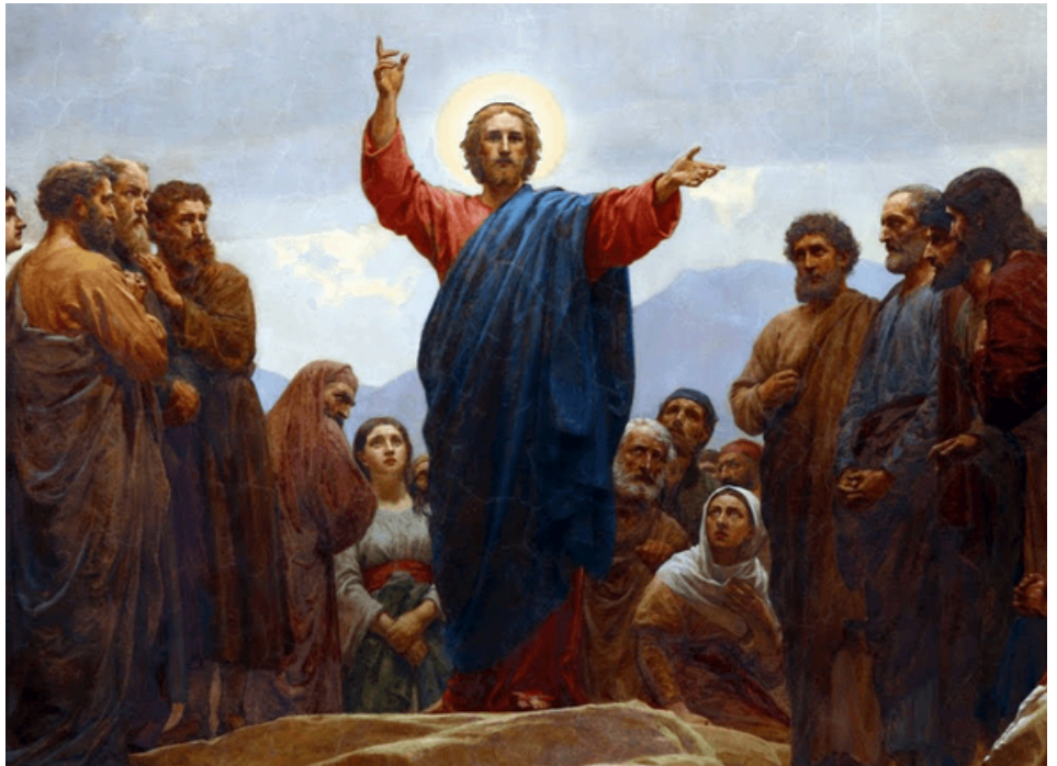
Copenhagen Altarpiece - "Sermon on the Mount" - detail Henrik Olrik